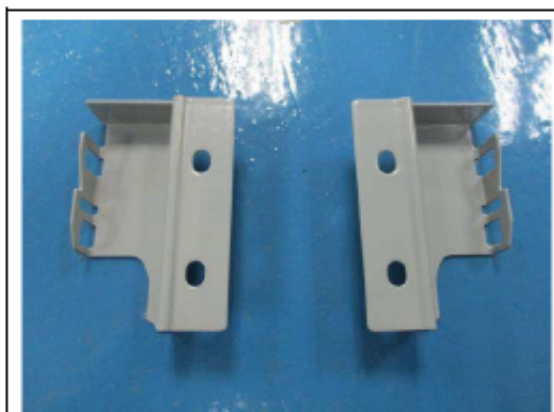
View 9 – Accessory