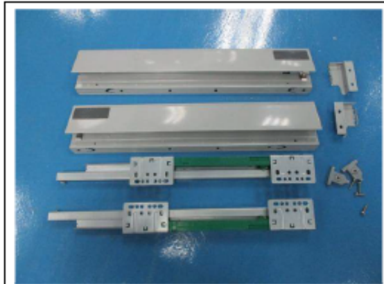
View 5 – Test sample and accessories