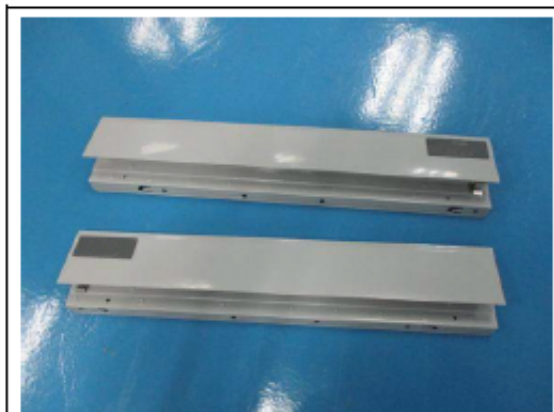
View 7 – Accessory