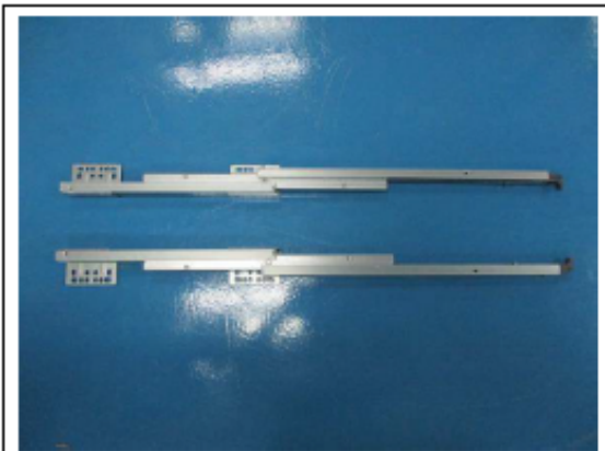
View 1 – Test sample