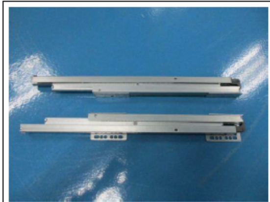
View 4 – Test sample