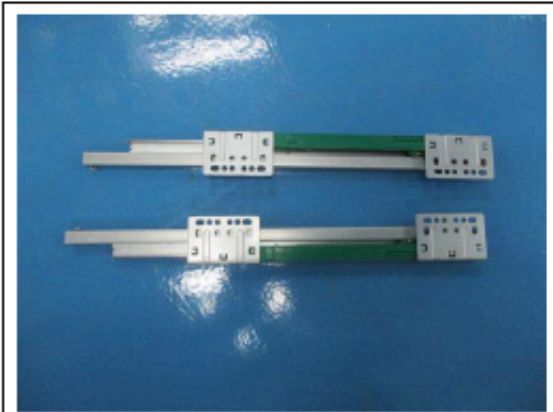
View 3 – Test sample