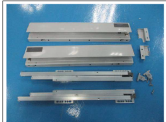
View 6 – Test sample and accessories