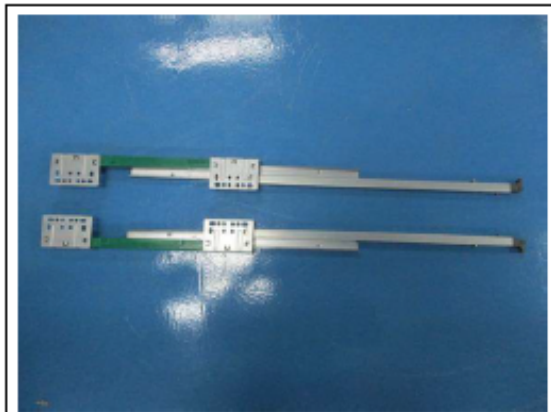
View 2 – Test sample