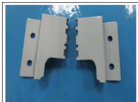
View 10 – Accessory