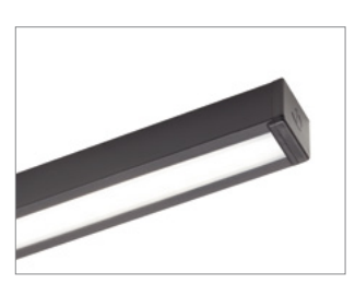
BLACK MATT (code 32)